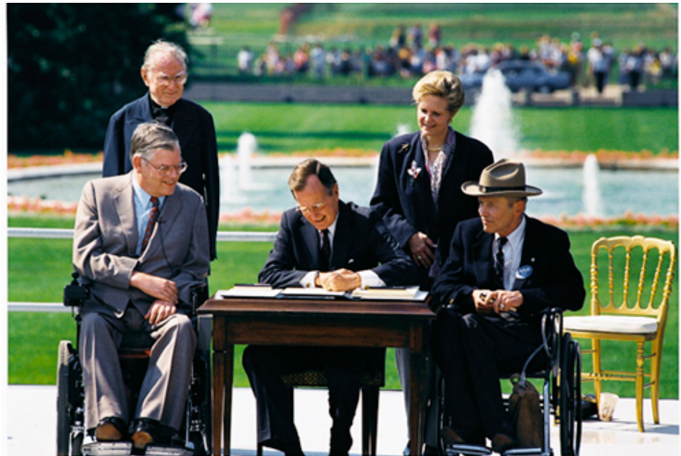
Signing of the ADA into law on July 26, 1990