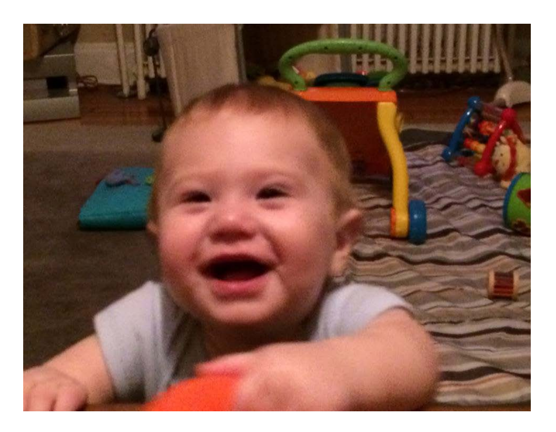
Public awareness of child development and the importance of families is critical.

Making sure all of our youngest children are screened and given support early are important priorities for the U.S. Departments of Health and Human Services and Education.